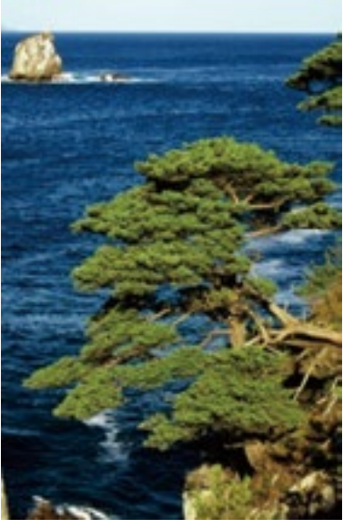
Far-Eastern State Marine Biosphere Reserve