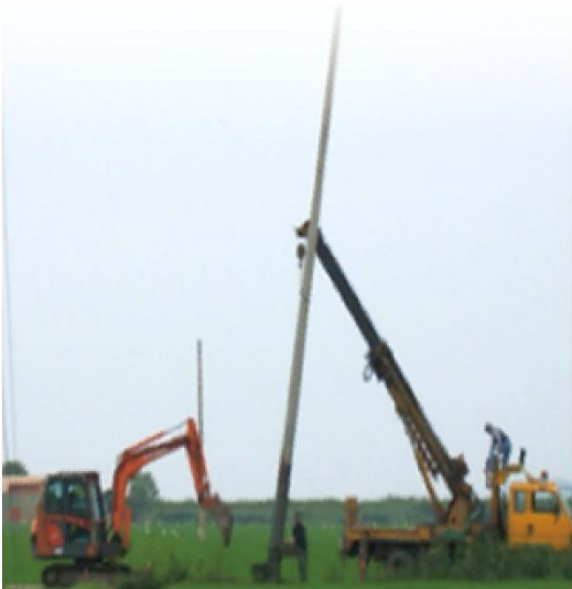
Underground cabling project

Removal of 282 utility poles and power lines for the benefit of migratory birds