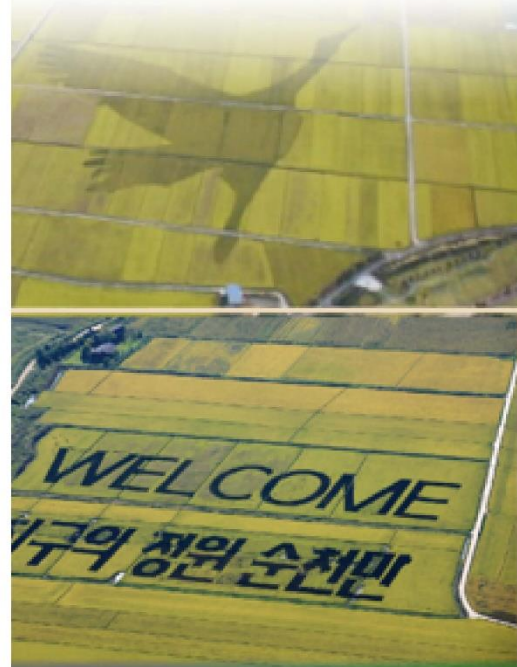
Designation of the first scenic agricultural zone in the country

Creation of a safe habitat for migratory birds through organic farming methods