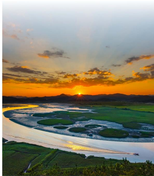
Designation of conservation zones for the ecosystems near Suncheon Bay(7.38km 2 )

Creation of a safe habitat for migratory birds through organic farming methods