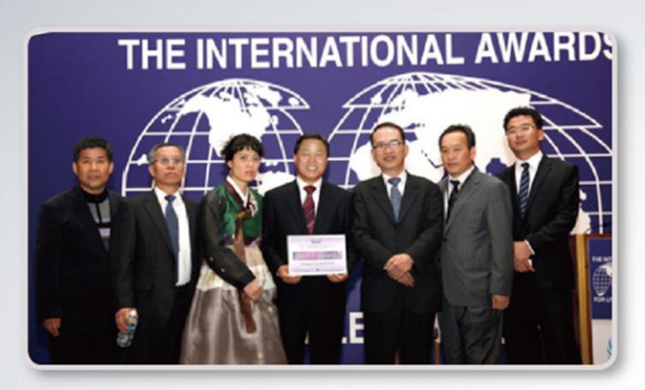
LivCOM Awards(살기좋은 도시대상) 은상 수상