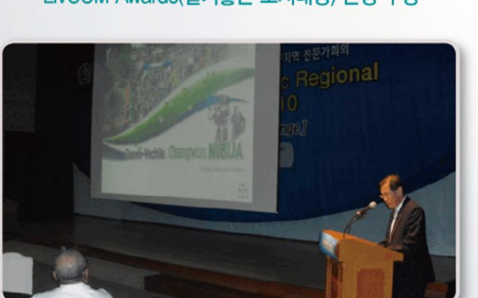
UN-HABITAT(유엔 인간정주위원회) 누비자 발표