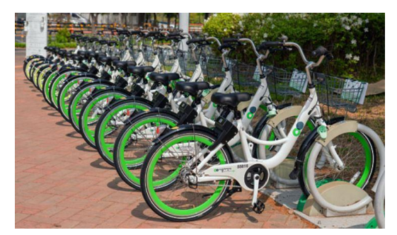
Figure 1: Ttareungyi

The SFC accepts requests for constructing the Ttareungyi bike stations via its main Ttareungyi website. A rental centre is largely composed of bicycles and bicycle racks, and can only be installed in areas with a sidewalk width of 3.5 meters (m) or more and a length of 5 m or more. Moreover, there has to be no interference with raised blocks for the visually impaired or with nearby facilities, such as fire hydrants. The location has to be considered as well, as there should be no difficulty in delivering bicycles, meaning that the bicycle rental centres cannot be constructed in a congested area or a spatially small area. If a requester wants the centre to be installed on a private land, the consent of the property holder is required. In the case of apartments, tenants' and owners' consent are required. Similarly, for the centres to be installed within the university campus, an official request by the university is required. If a store owner applies for a rental centre in front of the owner's store, the bike-sharing station can be named after the store name.