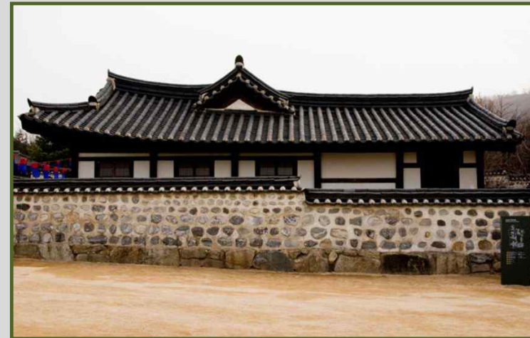
A traditional Korean-style house

ISO 14020 Environmental labels and declarations- General principles